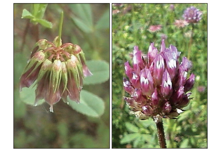
BLADDER CLOVER Trifolium depauperatum var. truncatum NATIVE ANNUAL CFMTD

occasional, moist grassy places, clay soils, <5000'. pl. small, <6". flwrs. white-tipped, inflated. photo: Cuyamaca Lake