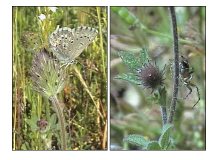
TREE CLOVER Trifolium ciliolatum NATIVE ANNUAL